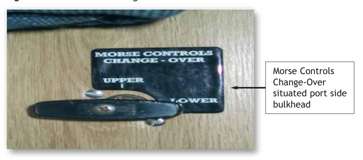
Figure 2 Morse Controls Change-Over

The Morse Controls Change-Over, which is situated under the main deck consol seat, outboard side was tested and operated satisfactorily. The selector switch was tested and operated satisfactorily.