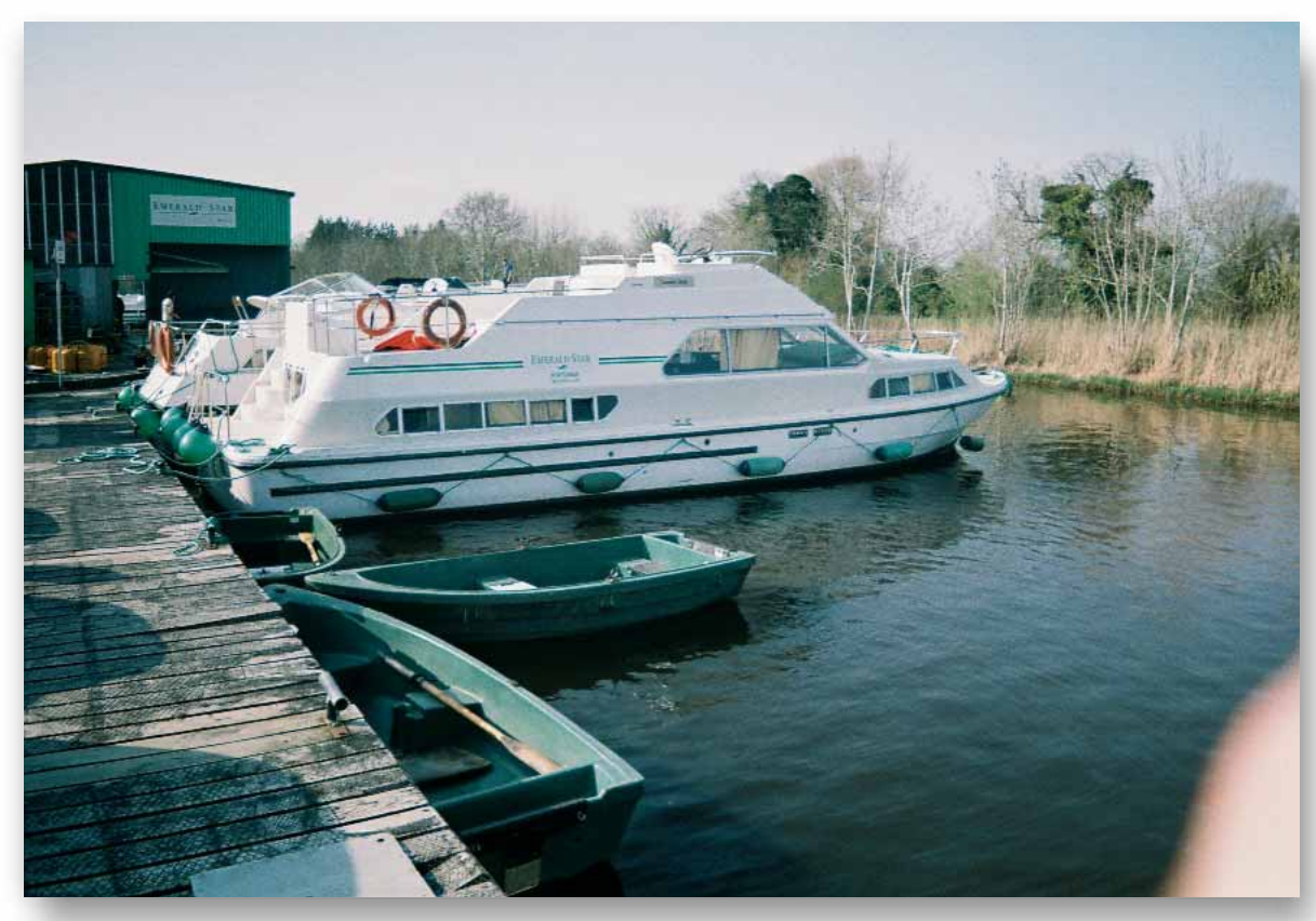
"Camlin Star" at Portumna.

Number of persons on board at time of incident: 8