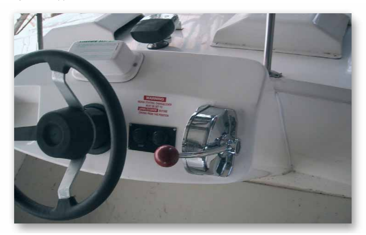
Figure 4 Upper Deck Helm Controls

Upper Deck Helm position showing the size of sign in context with the surrounding instrumentation and control systems.