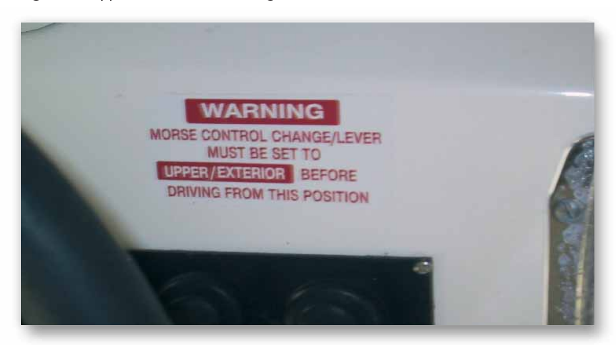
Figure 3 Upper Deck Helm Warning

Explicit instruction situated forward of the steering helm with respect to change-over control.