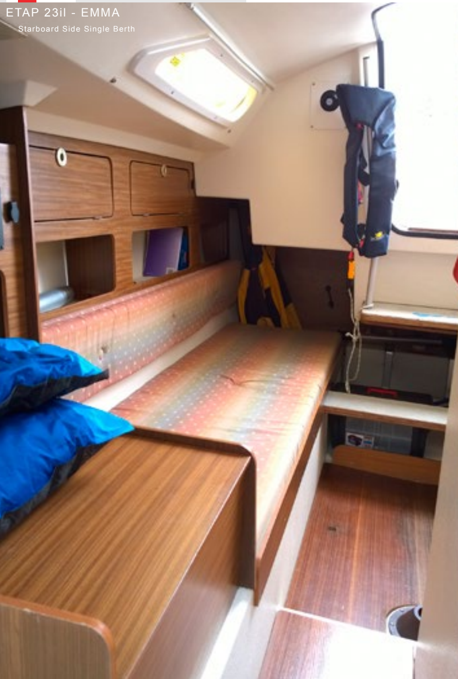
ETAP 23ii - EMMA Starboard Side Single Berth