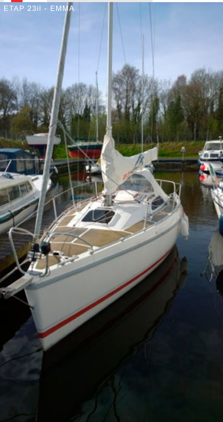
ETAP 23ii - EMMA