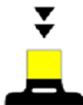
Cardinal Conventional Buoy