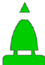
Lateral Conventional Buoy