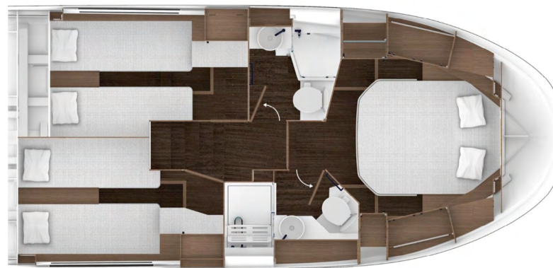
Plan - Cabins