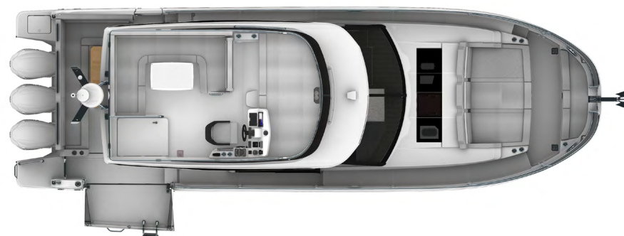
Plan - Flybridge