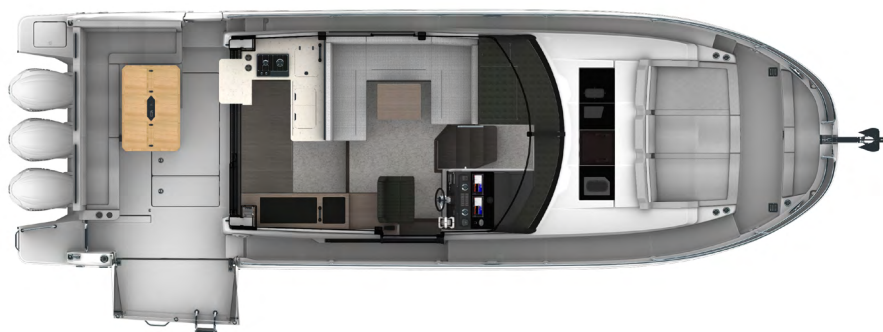
Plan - Layouts